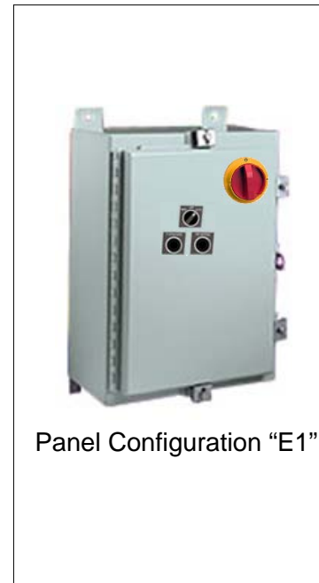
Panel Configuration "E1"