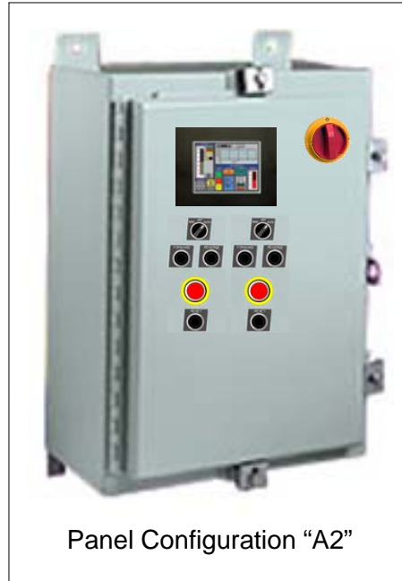
Panel Configuration "A2"