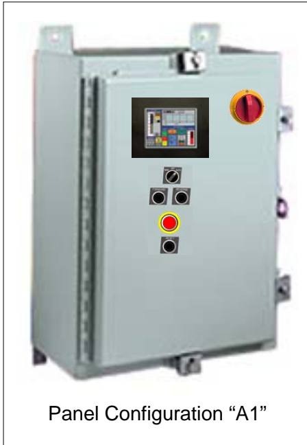
Panel Configuration "A1"