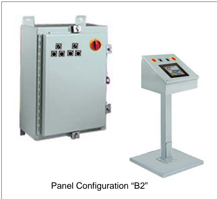
Panel Configuration "B2"